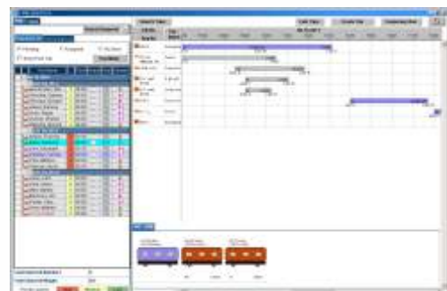
Consolidated view of multi-type land dispatch operations