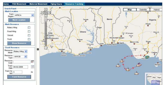
Map-based interactive real-time asset tracking & reporting